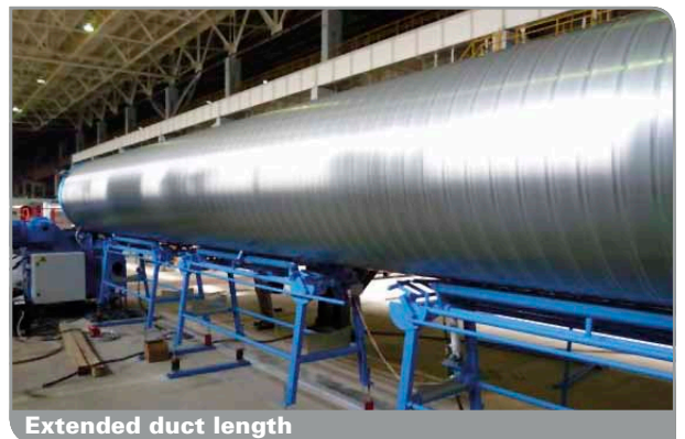
Extended duct length