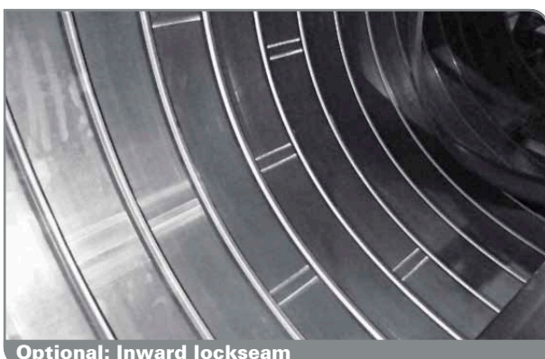
Optional: Inward lockseam