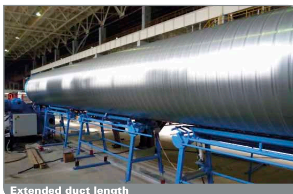
Extended duct length